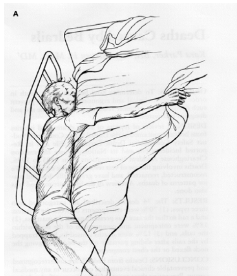
Figure A. Entrapment between a bed side rail and a mattress (limit the maximum horizontal gap to 60 mm or 2 3/8 inch)

Gaps between the bed mattress and bed side rail in beds occupied by high risk patients (frail, elderly, confused, physically impaired) will be limited to those permitted for new bed assemblies. In the interim all bed assemblies that have gaps that do not conform to the requirements for new beds will be filled or covered with suitable materials to reduce the risk of entrapment. Suitable materials include high-density, fire retardant foam wedges that do not obstruct staff's visibility of the patient. Velcro or anti-skid mats may be used to position the mattress on a bed frame in lieu of foam wedges provided the opening (between the mattress and side rail) on each side of the mattress is limited to, and maintained at, less than 60 mm (2 3/8 inches). When replacement mattresses are purchased for existing bed frames the mattresses must be of a sufficient length, width, and thickness to meet or exceed requirements for new assemblies.